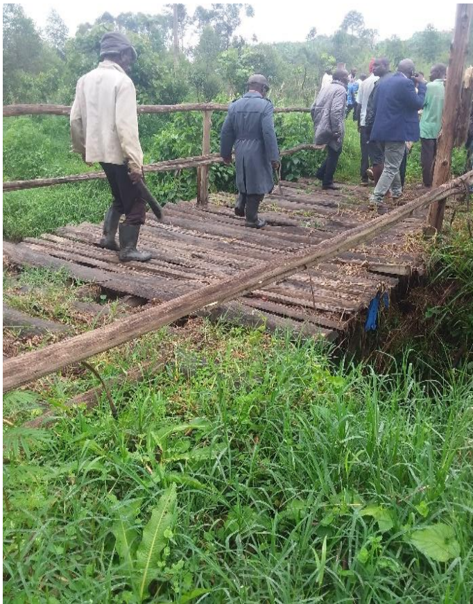
The current state of the Bashama Bridge