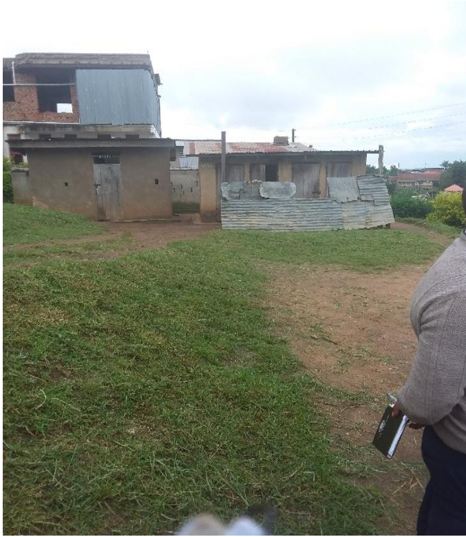
old latrines at Rukungiri Primary School