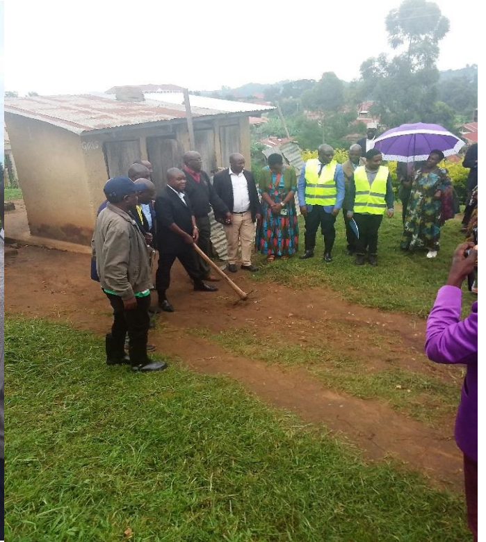
RDC commissioning the latrine construction at Rukondo Primary School