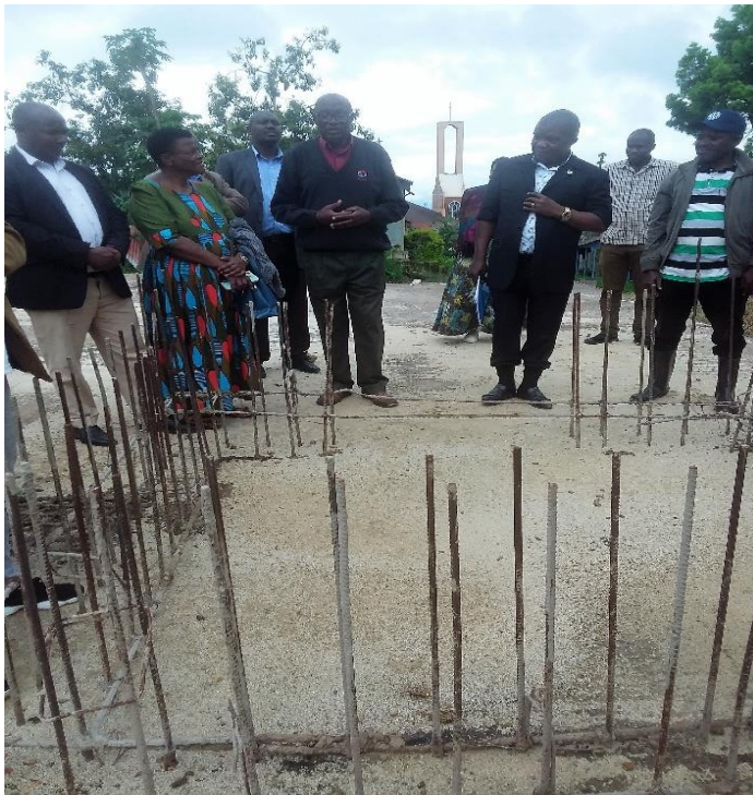
The speaker Rukungiri Municipality, His worship the Mayor and the RDC at the RMC office block construction site